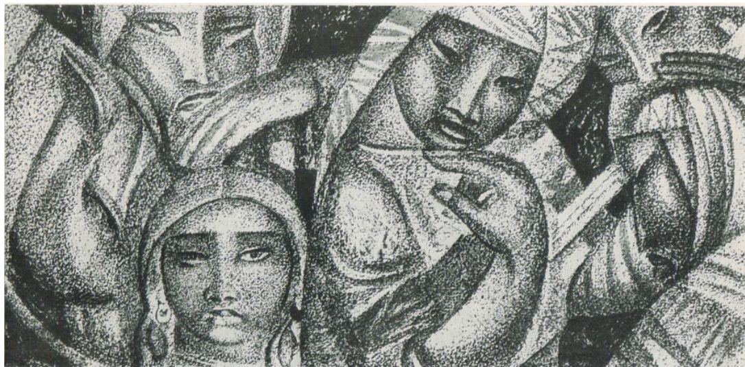
E. Sidorkin. Dust jacket for Mukhtar Auezov's novel «Abai's Way».1970

viewer guesses the pose of the sitting Abai; an expressive gesture of the thinker's raised hand holding a pen. «...The night passed without sleep. Only at dawn did Abai lie down for a short time, not feeling tired. Soon he returned to the table heaped with open books...» [1, Vol.1, 353 p.].